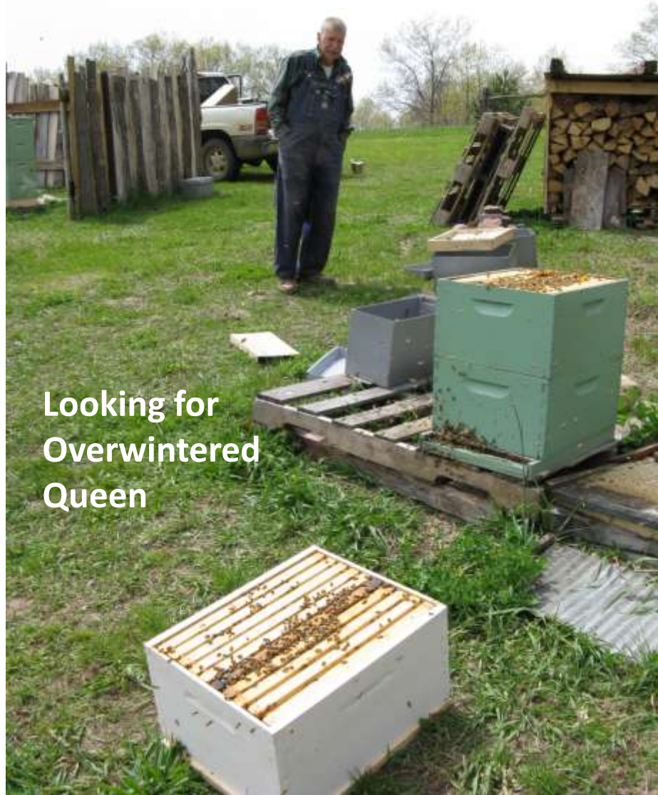
Looking for Overwintered Queen